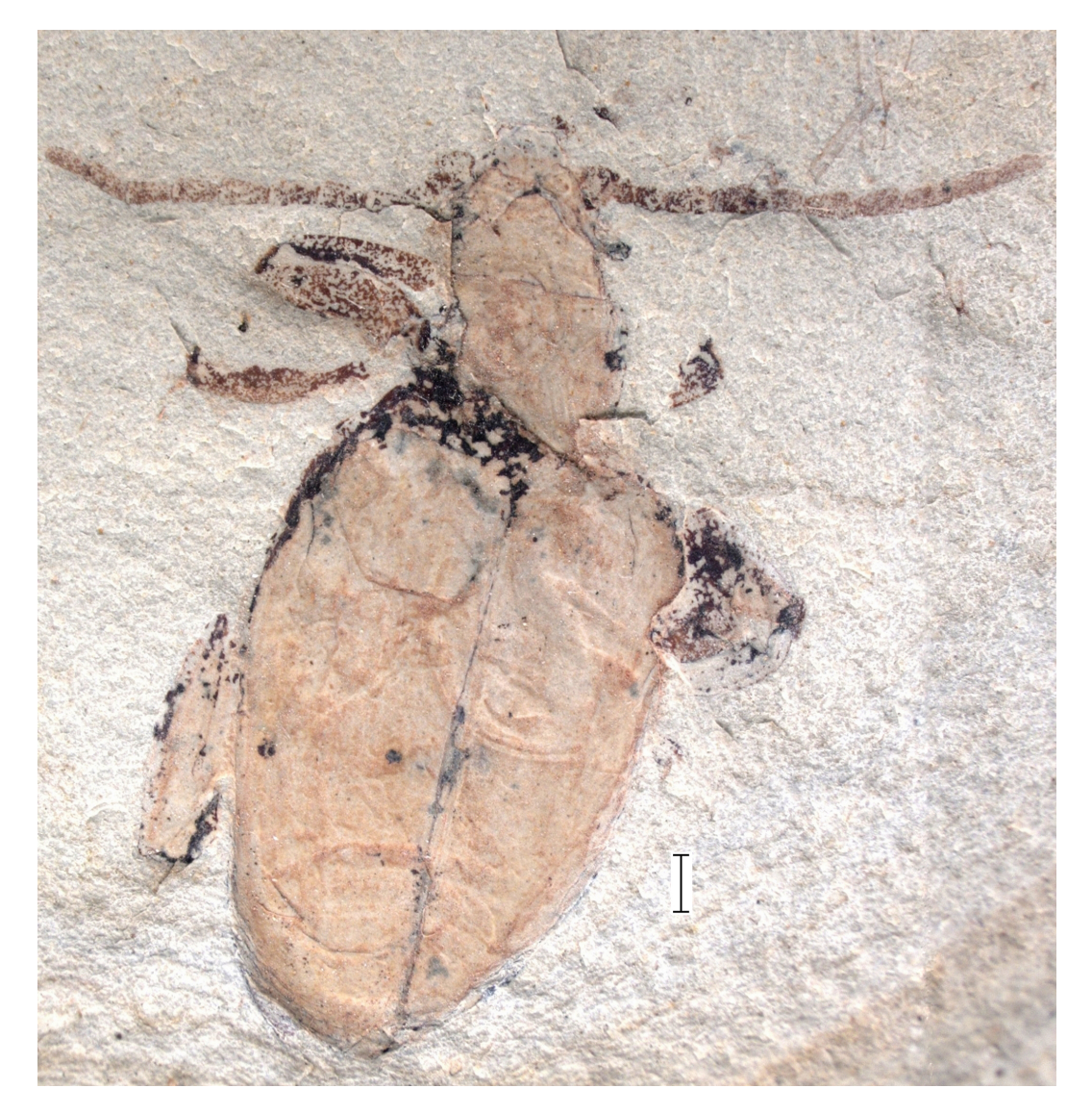
Figure 1. Body of the counterpart of Palaeatalasis monrosi sp. nov., holotype, GR2020/2 (ISEA). Scale bars = 1.0 mm.

1.3 times as long as wide. Antennomeres 2-10 conical. Antennomere 2 1.3 times as long as wide, 0.5 times as long as and 0.4 times as narrow as antennomere 1. Antennomere 3 1.7 times as long as wide, 1.3 times as long as and equal in width to antennomere 2. Antennomere 4 2.0 times as long as wide, 1.3 times as long and 1.1 times as wide as antennomere 3. Antennomeres 5-9 subequal in width. Antennomere 5 2.4 times as long as wide, 1.4 times as long as antennomere 4. Antennomere 6 1.8 times as long as wide, 0.7 times as long as antennomere 4. Antennomeres 7-10 subequal in length. Antennomere 7 2.2 times as long as wide, 1.3 times as long as antennomere 6. Antennomere 10 2.8 times as long as wide, 1.1 times as long as and 0.9 times as narrow as antennomere 9. Antennomere 11 3.0 times as long as wide, 1.1 times as long as and equal in width to antennomere 10, weakly pointed at apex.